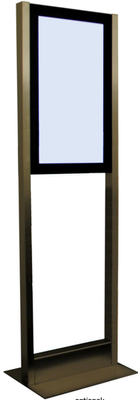
optional: base plate made of stainless steel

The H-Type is a professional information and display system for a wide range of applications.